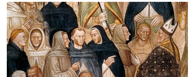
Andrea di Bonaiuto, Ecclesia Militans (c. 1365), Detail. Florence, Santa Maria Novella.